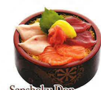
Sanshoku Don $15 Salmon, Tuna & Swordfish 三色丼