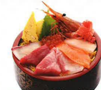
Tokusen Chirashi Don $25 Premium Assorted Sashimi 特選チラシ