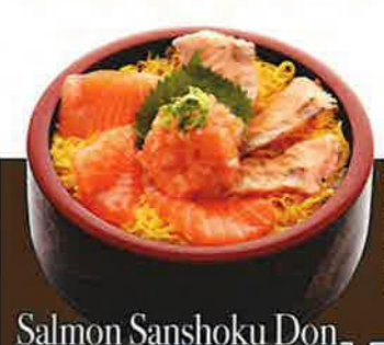
Salmon Sanshoku Don $15 Salmon, Broiled Salmon & Salmon Negitoro