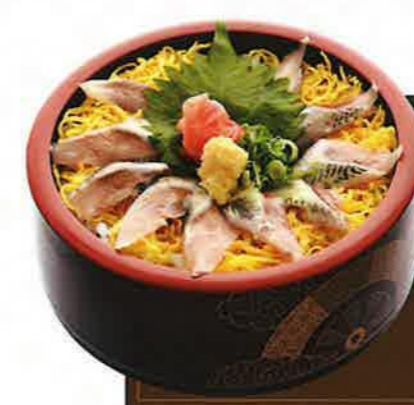
Hokkaido Otoro Iwashi Don Fatty Sardine from Hokkaido 北海道産 大トロ鰯丼 $15