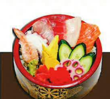
Chirashi Don $15 Assorted Sashimi