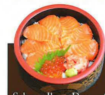
Salmon Ikura Don $15 Salmon & Salmon Roe