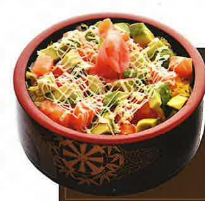
Salmon Avocado Don Chopped Salmon and Avocado with Mayonnaise Sauce サーモンアボカド丼 $15