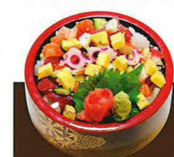
Bara Chirashi Don $15 Assorted Chopped Sashimi