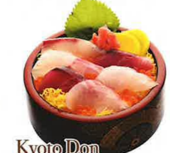
Kyoto Don $15 3 Varieties of Specially Selected Fish from Japan with Salmon Roe 京都丼 (日本直送地魚三種使用)